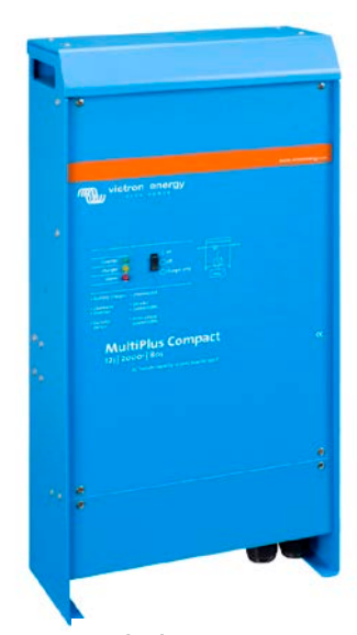
MultiPlus Compact 12/2000/80