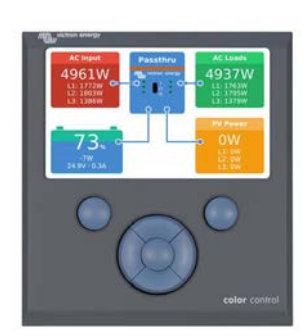
Color Control panel, showing a PV application

When connected to the Ethernet, systems with a Color Control panel can be accessed and settings can be changed.