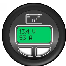
▶ Round SOC Display

NOTE: CONTACT LITHIONICS BATTERY® FOR A USER INSTALLATION GUIDE & STORAGE PROCEDURES. FOLLOW THE GUIDE TO ENSURE FITNESS OF USE & WARRANTY.